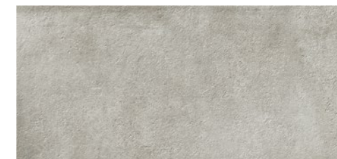
STARGAZE GREY 12X24 Code: STZ-GR-1224 Size: 12x24"