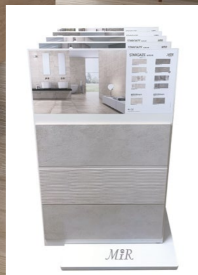
STARGAZE DISPLAY Size: 32x33x54", Weight: 250 Lbs