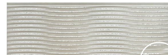
STARGAZE CASSIOPEA GREY Code: STZ-CAS-GR Size: 9.8x29.5"