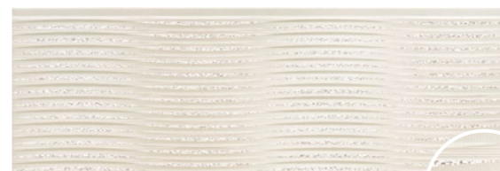
STARGAZE CASSIOPEA WHITE Code: STZ-CAS-WHT Size: 9.8x29.5"