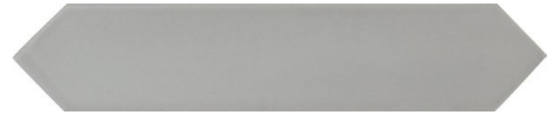
Alfama Pickets Gray Code: ALF-GRAY Size: 2x10"