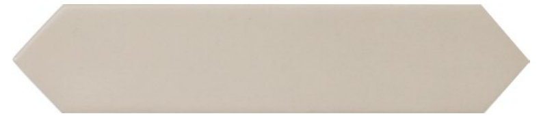
Alfama Pickets Muslin Code: ALF-MUS Size: 2x10"