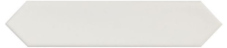
Alfama Pickets White Code: ALF-WHT Size: 2x10"