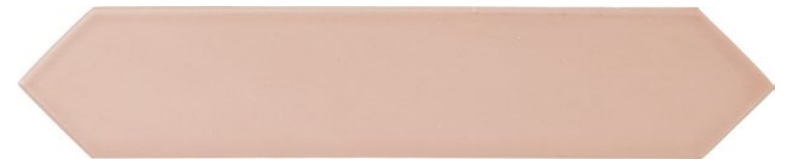
Alfama Pickets Rose Code: ALF-ROSE Size: 2x10"