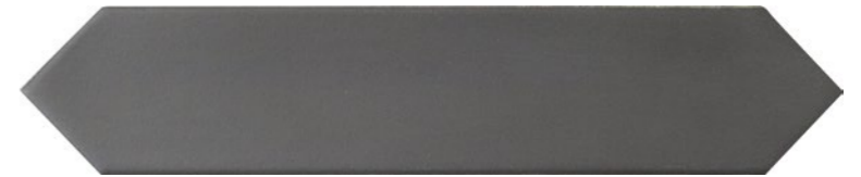
Alfama Pickets Black Code: ALF-BLK Size: 2x10"