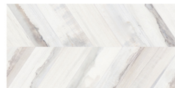
ACADIA SPIGA BLANCO Code: ACD-SP-BL Size: 17.7x35.4"